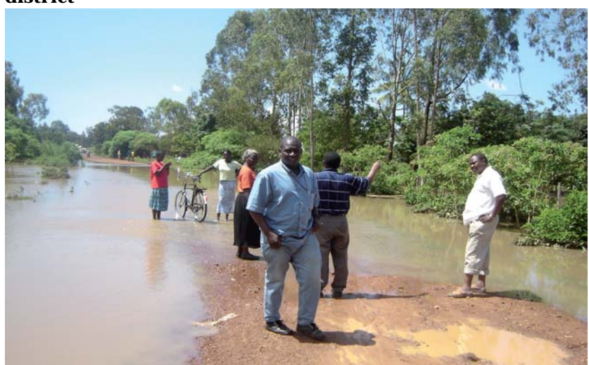
Figure 2.2: Flooding menace in Budalangi division, Bunyala district

wood collected for firewood from the village commons, and EXPEND is household expenditure as a proxy for household income.